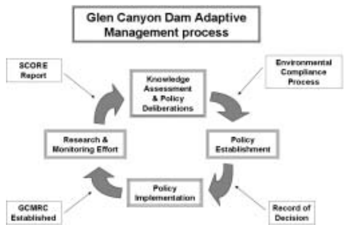
Figure 2 Conceptual illustration of the Glen Canyon Dam Adaptive Management Program process. GCMRC refers to the Grand Canyon Monitoring and Research Center of the U.S. Geological Survey, established as the science provider for the Program. The SCORE report refers to the State of the Colorado River Ecosystem in Grand Canyon publication synthesizing the state of scientific knowledge for the Program (Gloss et al. , 2005). The next step in the process is knowledge assessment and policy deliberations after which the cycle will continue. Refer to text for additional details.

Sustainable river management involves interrelationships among assessments of ecological risk (Nilsson et al. , 2005), sustainable management, dealing with uncertainty, adaptive management and decision support (Clark, 2002). While adaptive management